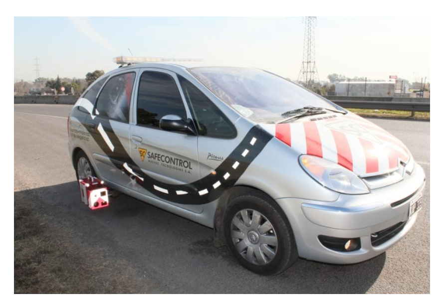
Mobile retroreflectometer ZDR 6020 of the company Zehntner

The Dirección Nacional de Vialidad ("National Roads and Highways Bureau") of Argentina pressed ahead with the mobile control of road markings optimizing its resources with the help of the latest technology. The signalization has been developed systematically therefore also the traffic safety on national roads improves continuously.